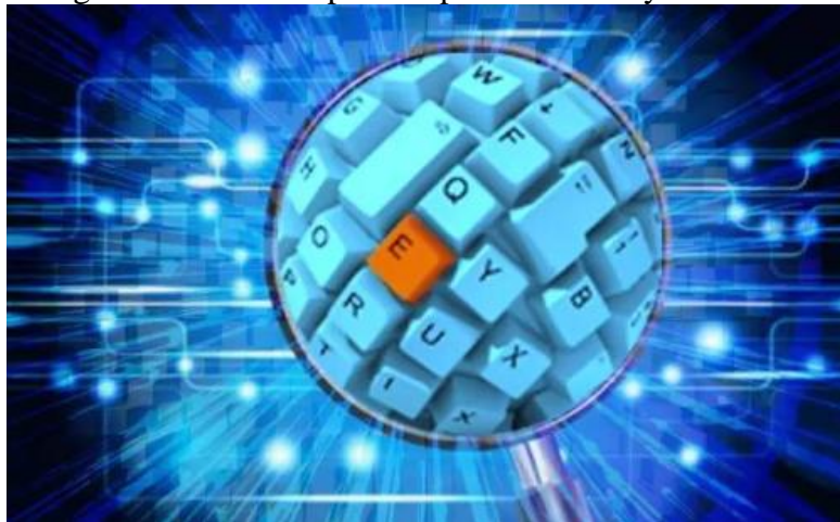
Fig.1 The Era of Self Media

The era of self media is a new era of media. Everyone has a microphone to speak, and more and more people express their opinions on the Internet, including social hot spots, current affairs, politics and daily life. In this group, young people occupy a large part. As the communicators of network information, they can not carry out one by one in the face of a large amount of information Discrimination, resulting in the spread of a large number of false information, but also to bring a trace of instability to the network environment, so in order to maintain the stability of the network environment, we should guide the Internet public opinion correctly.